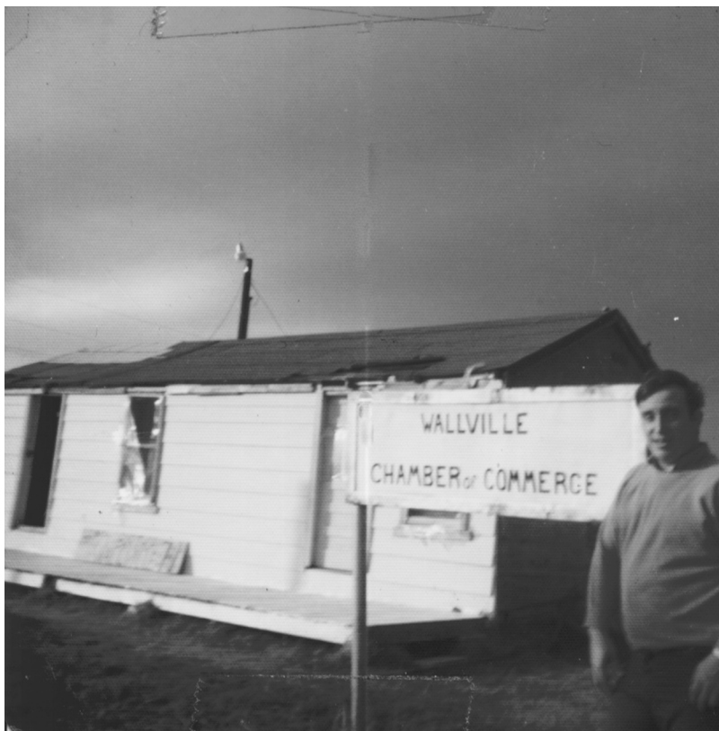
An Alton Hunt sighting at the lost City of Wallville.

Turn off the highway and let's go down the Wallville Road. From the mailbag, March 12, 2009.