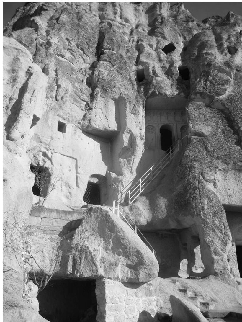
This is a look at one of the volcanic formations that has several caverns carved into it. Each of the caves served as a chapel of some sort for the persecuted Christians.

While everyone in Oklahoma was off for spring break, all the kids here on base were still going to school. Their spring break isn't for two more weeks! That didn't stop me from having a weekend getaway. This past weekend was the weekend that I have been planning to spend in Cappadocia, Turkey for a women's retreat, and we all had a wonderful time!