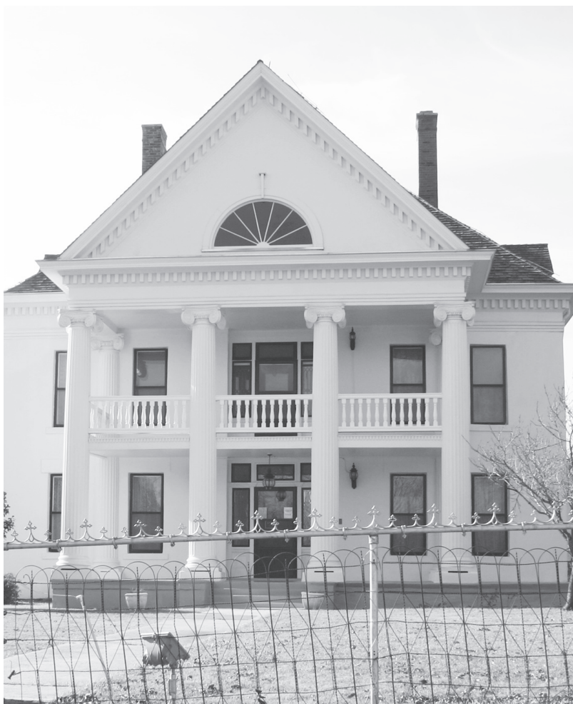
The Murray Lindsay Mansion will be sight to Insight Paranormal Investigations.

the mansion 30 minutes prior to the event starting.