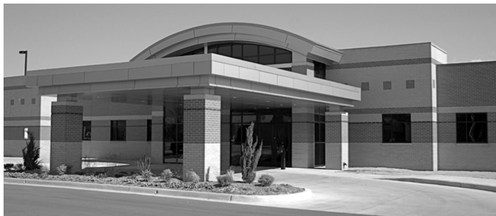
1200 East Broadway • Altus, Oklahoma • 580.480.4400