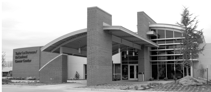
2110 Duncan Regional Loop Road • Duncan, Oklahoma • 580.251.6600

Together, Comanche County Memorial Hospital in Lawton, Duncan Regional Hospital in Duncan and Jackson County Memorial in Altus combined their resources and expertise to create a new tradition in health care — Cancer Centers of Southwest Oklahoma. With the construction of two facilities completed and one in the midst of construction, patients can receive the care they need - right here at home.