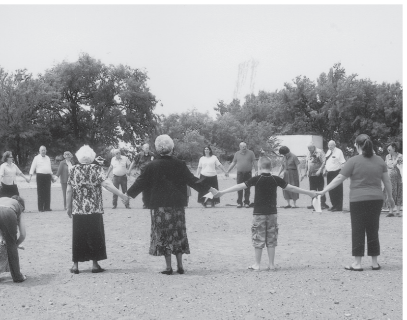
The Cox City Baptist Church had a ground breaking ceremony June 28 at their new building site, where the Cox City School was formerly located. The members gathered for a circle of prayer to ask the Lord's blessings as the church prepares to build their new church building to better serve the Cox City Community.